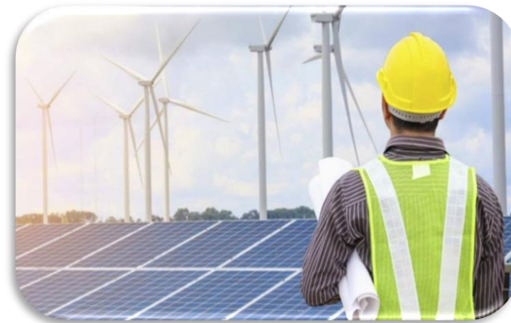
Construction & Renewable Energy