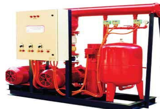
Light Engineering products