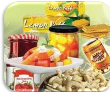
Processed foods & beverages