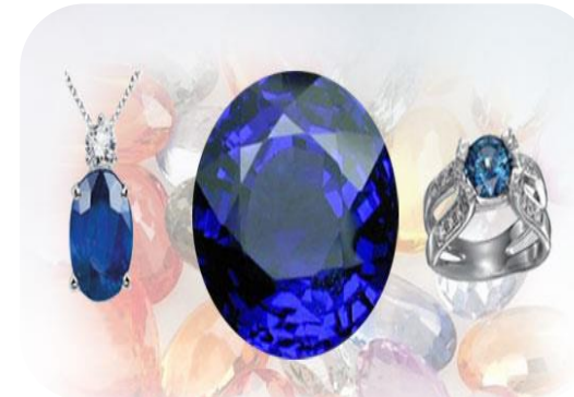
Diamonds ,Gems & Jewellery