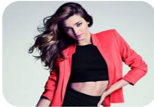
Textile & Apparel