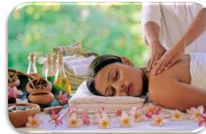
Wellness & Healthcare