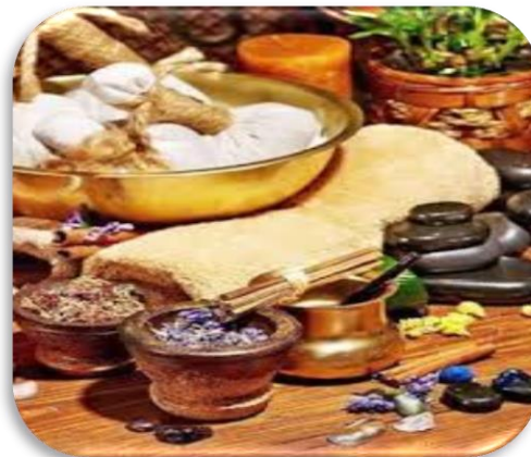
Ayurveda & herbal products