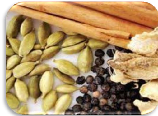
Spices & concentrates