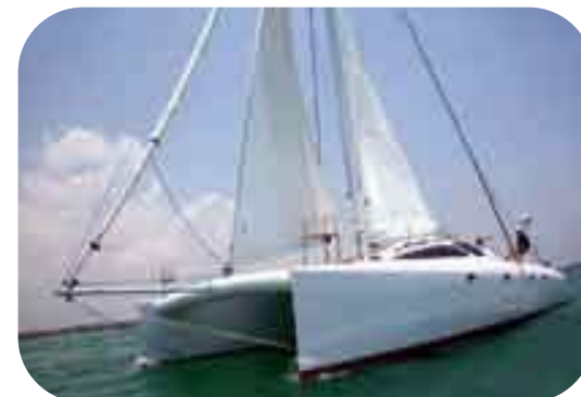
Ship & Boat building