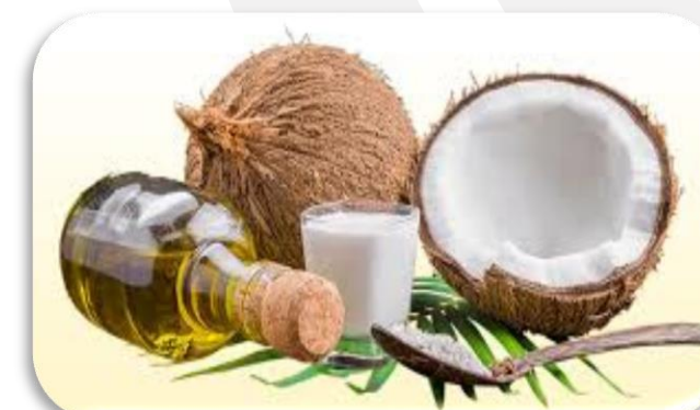
Coconut related products