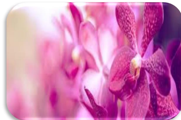
Cut flowers & foliage