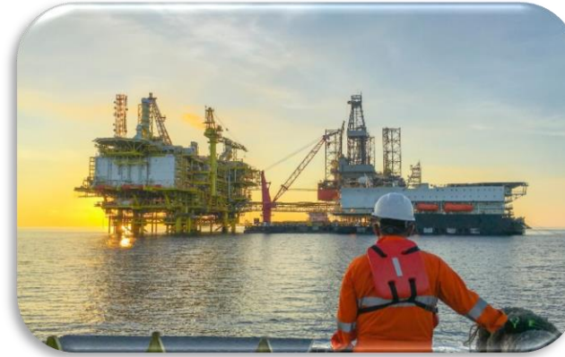
Marine & Offshore