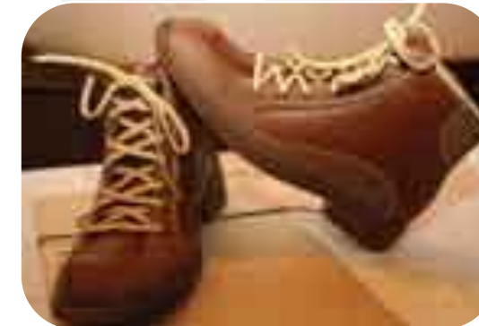
Footwear & leather products