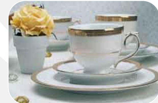
Ceramic & Mineral Based Products