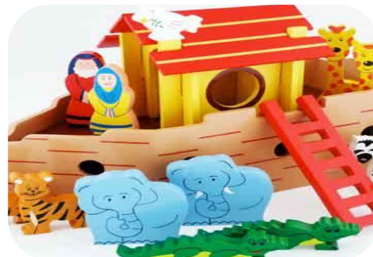
Giftware & Toys (including craft)