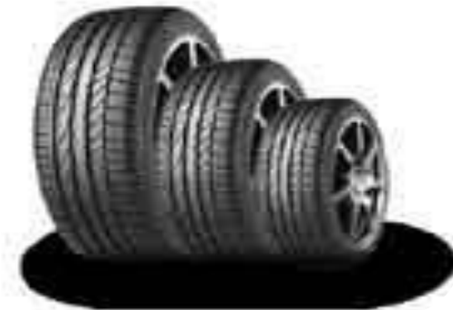
Rubber & Rubber based products