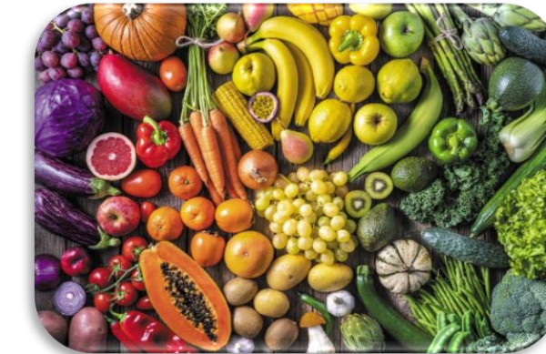
Fruits and Vegetable