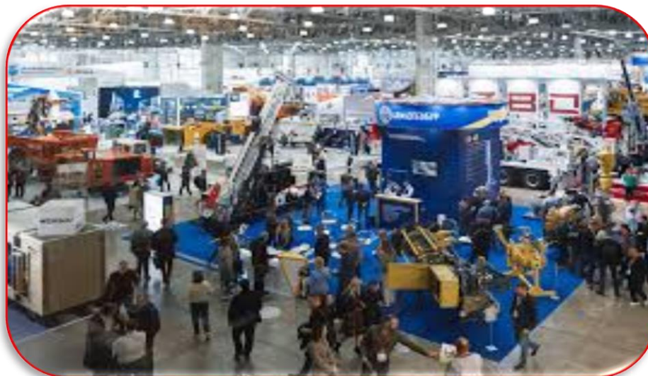
International Pavilion (High Tech solutions, Machinery & tools)